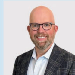
CHEZ TSCHETTER SOLARITY/EDCO